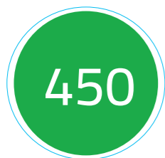
Products We Work On

Cereals Wheat Corn Barley The Rice Vegetable