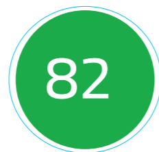
Countries To Which We Export