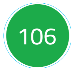
Countries To Which We Import