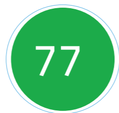
Real Clients And Good Relationships